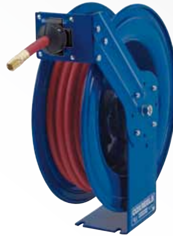
Dual axle support with Super Hub™ for added strength

SH Series Super Hub™ spring driven hose reels, like the P Series, have a history of dependable performance. The larger chassis and frame accommodate longer lengths and larger diameters of hose. The dual axle support system increases the stability during operation, reduces vibration and strengthens the structural integrity of the reel.